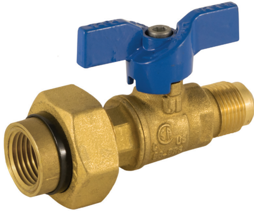
T-204DU FIP x FL