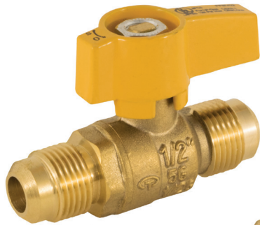
Flare x Flare