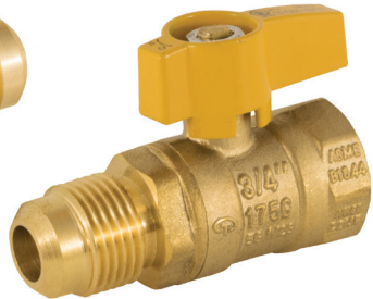
Flare x FIP T-2004C