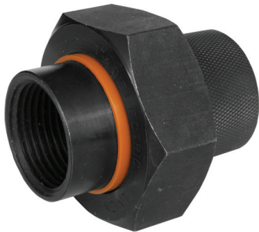
Black Iron FIP x FIP