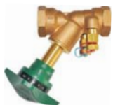
1/2" - 2"

Fixed Orifice - Globe Style Balancing Valve