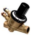
1/2" - 3/4" *