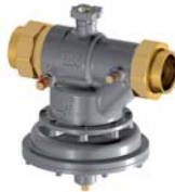
1-1/2" - 2"