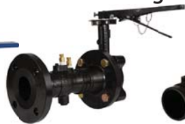
2-1/2" - 8"