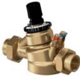
3/4" - 1-1/4" *