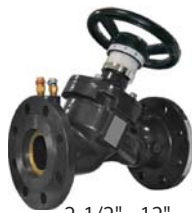
2-1/2" - 12"