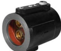
2-1/2" - 8"