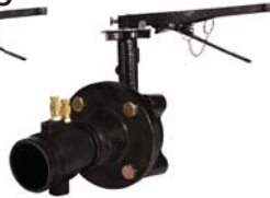
2-1/2" - 8"