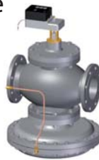
2" - 6" *