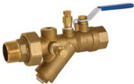
1/2" - 2" *